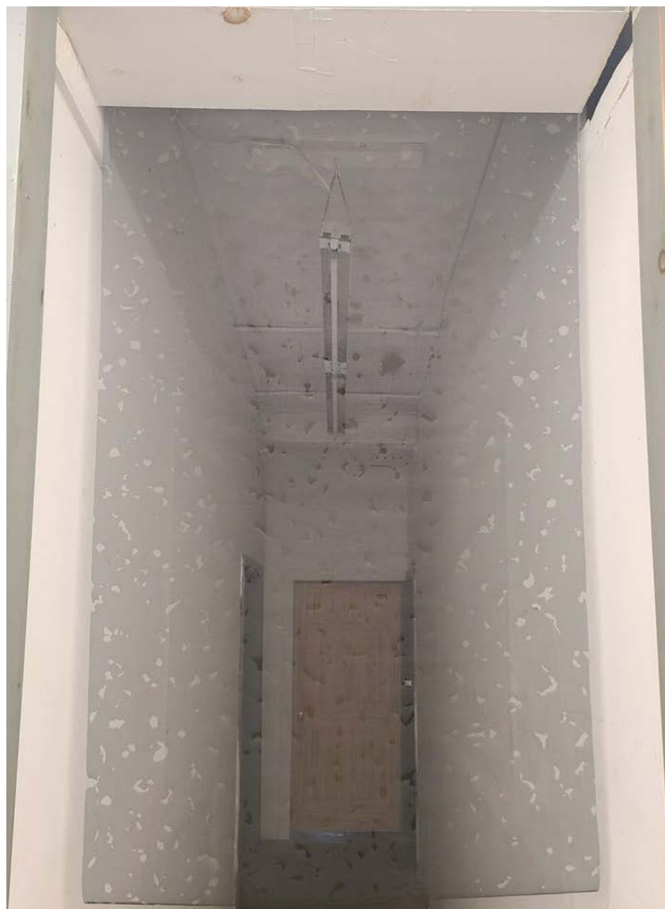
At Mohonk Arts, Megan Pahmier, "fall-out 20/21" (2021), fiberglass window screen, steel pins (one view)