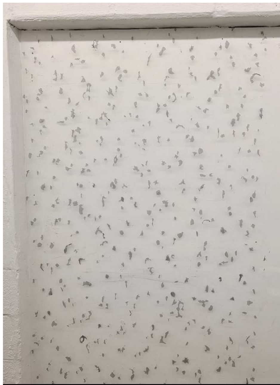
At Mohonk Arts, Megan Pahmier, "fall-out 20/21" (2021), fiberglass window screen, steel pins (the other view)