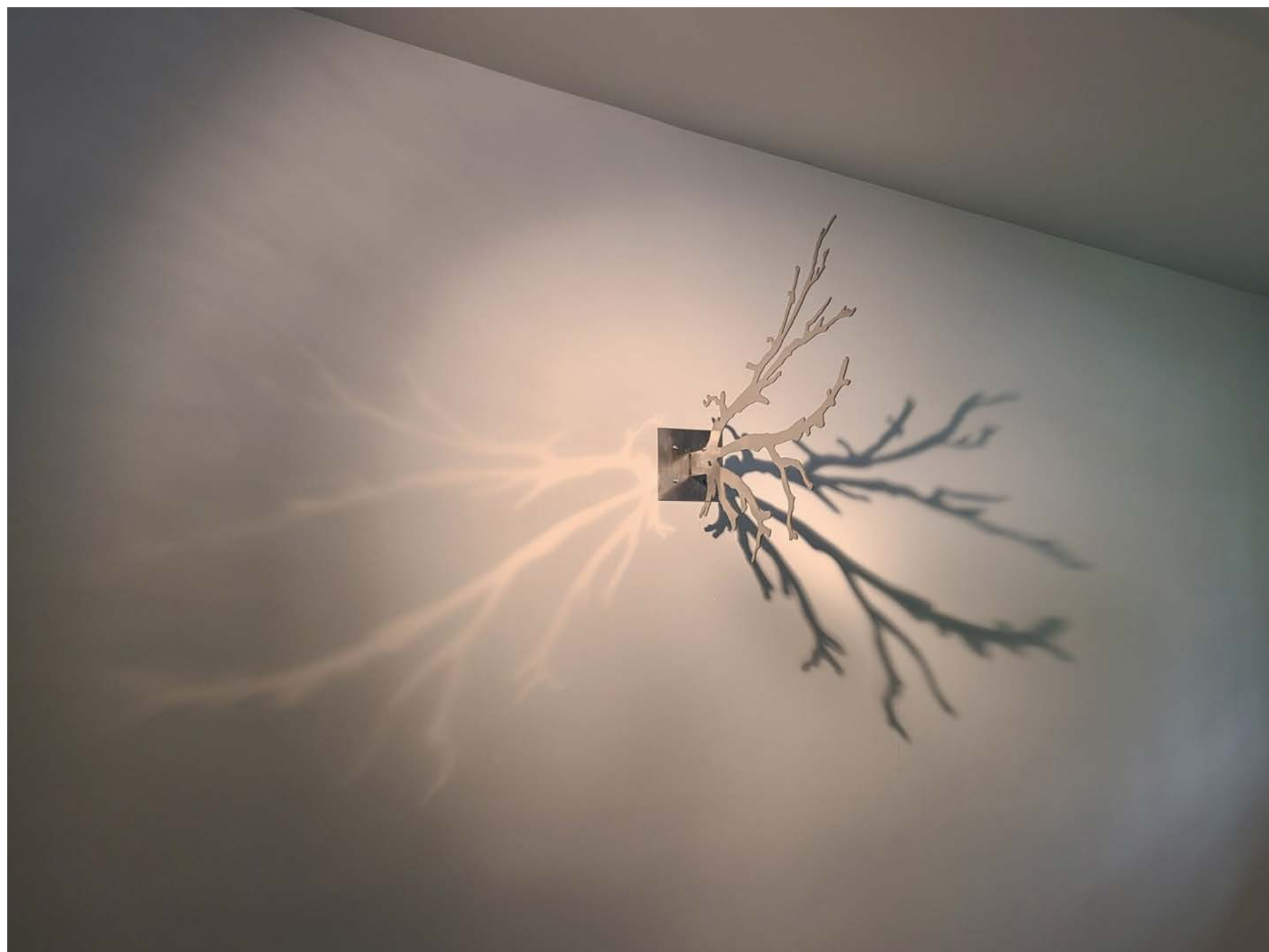
Suzy Sureck, "Branch" (2017) digitally water cut stainless steel, 26"h x 6"w x 23"d