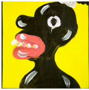
Jeffrey Hargrave/Bronx Museum