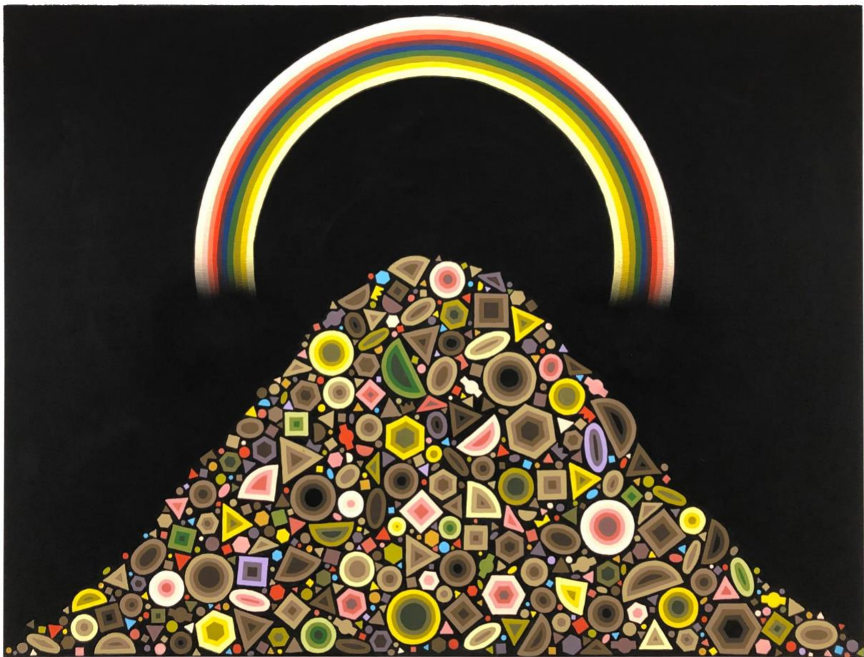
“Future Presence,” 2021, Gouache on panel, 18 x 24 inches.

“It was the best of times, it was the worst of times.” Not only that, but the present is not enough. The world is becoming much more specifically restrictive for trans people, and then at the same time there’s simultaneously a lot of things that are better, like accessing trans affirmative medical care has become much easier for me over the past decade. Having complex identities, and language around trans identities has become much more widely accepted in the past few years, and open to nuance in a way that it hasn’t been a wide way before, which I think is very exciting. But this legislative targeting is really ferocious and terrifying and part of these larger patterns of oppression.