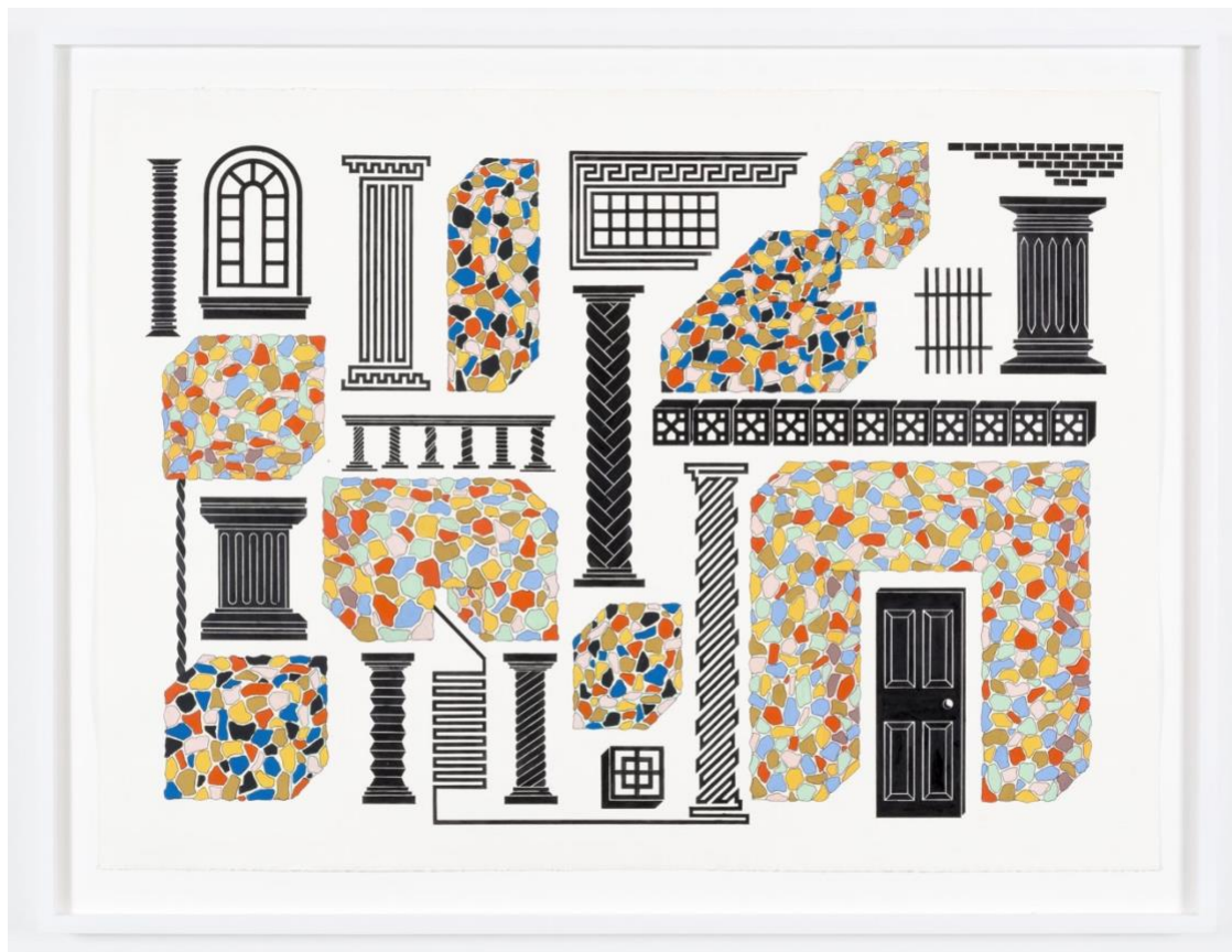
"Before Stonewall," 2015

I feel like I spent a lot of years as a nomad, but I feel like I have an umbilical cord relationship to Chicago. At the same time, I know that my idea of what the city is isn't set in stone, and that every time I come back to it, it's a changed place. It's the first place where I started having art shows and I feel close to the integrity and the resourcefulness of the art scene in Chicago. I also don't know what to expect, because every time I return to it as a place it's different. Still, I do feel tethered to it in almost a magical way. It's a formative place for me, and a place where I solidified something that my work continues to grow out of, looking at queer history and queer space, why I do that, and different methods for doing that.